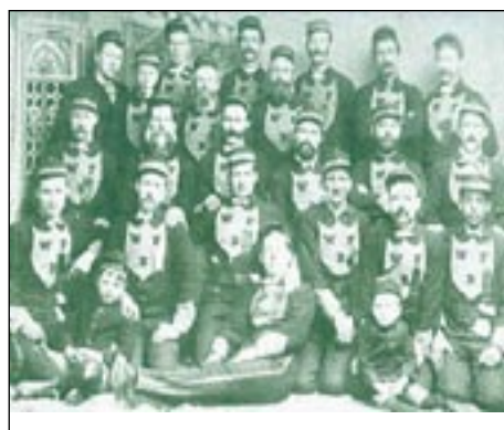
1885 - Whitby Fire Brigade