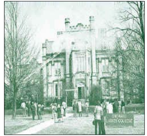
1973 - Ontario Ladies College fire

In 1973 the Department purchased a MACK 100' Aerial Pumper truck. This timely acquisition was put to good use on December 1st, 1973, when a fire broke out at the Ontario Ladies College.