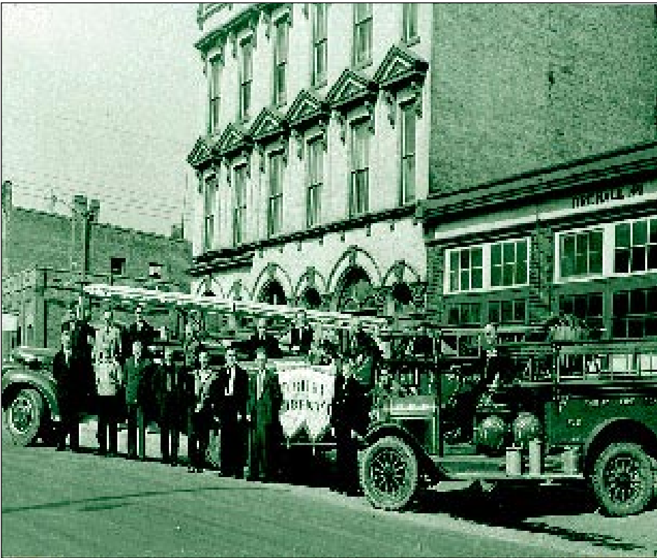
Hall 3 - Brock St., 1947 - Whitby Fire Department

Council to act on the matter. In October of 1872, the long awaited Merryweather Steam Fire Engine arrived, from London England.