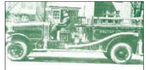
1885 - Merryweather Steam Fire Engine

the village of Oshawa to obtain that community's fire engine service. The rider was unable to locate the Reeve of the Village, who held the only key to the fire engine. The fire loss was extensive, causing damage amounting to $40,000.00.