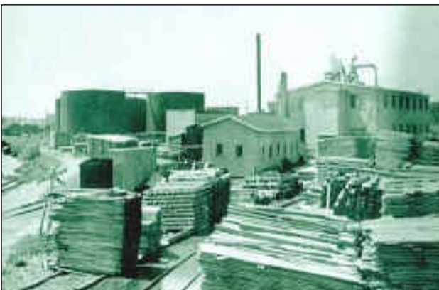
1) 1951 - Brunton Lumber Yard before & during fire