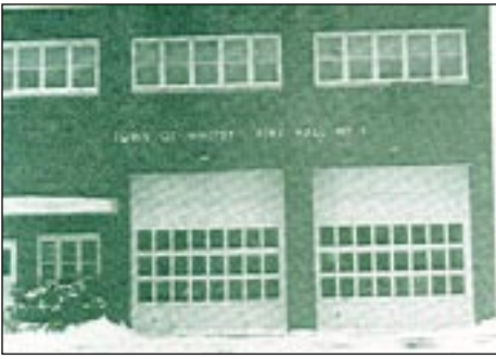
Brooklin (Hall 1)