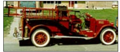
1924 - Reo

Lawler's store. Almost the entire east side of Brock Street from Dundas to Colborne was destroyed. Many businesses were gutted, with the total loss amounting to $150,000.00. The Merryweather and the Oshawa fire engines pumped the Town wells dry that day.