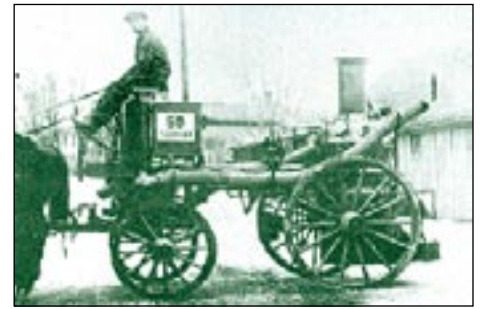
1885 - Merryweather Steam Fire Engine

In 1857, the Town was in a panic, over a series of mysterious fires. Was an arsonist on the loose? Two fires destroyed large sections of the downtown business area. On Halloween night, one of these suspicious fires broke out. A rider was sent to