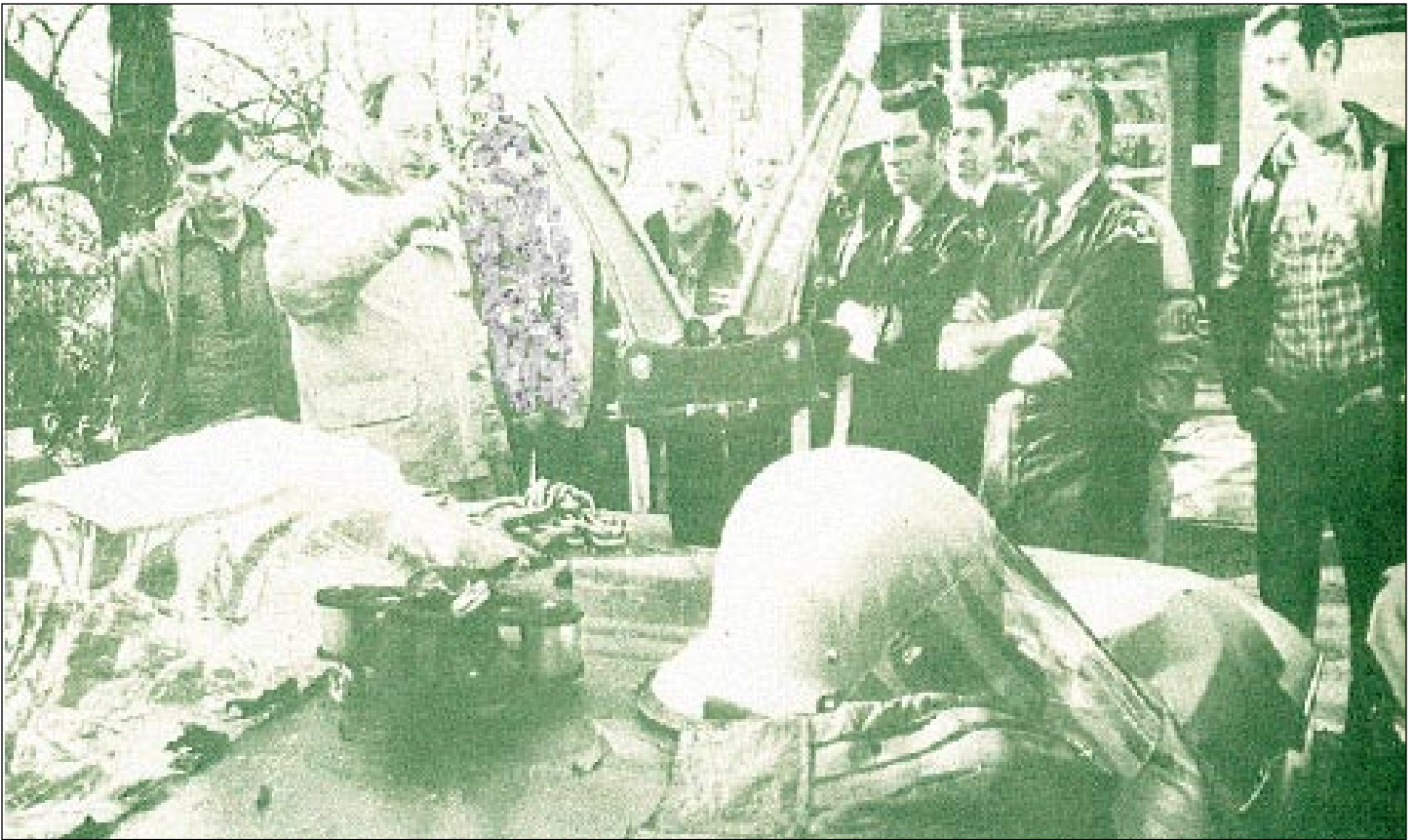
1978 - "Hurst Jaws of Life"

Today, Whitby Fire & Emergency Services consists of 97 full time staff, 2 part time staff, and 16 volunteer fire fighters. Our new Fire Services Headquarters, located on McKinney Drive, opened in 1995. This building includes Administration, a Fire Hall (5), Communications Centre, Training Room, and a Public Education Room. In the year 2000 Whitby Fire & Emergency Services, broke ground for a new Fire Hall on Dundas Street West.