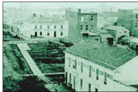
1863 - photo of damage to N/W corner Brock & Dundas following 1857 fire

Department came under jurisdiction of the Council's Fire & Water Committee. The engine company consisted of 25 men and the hook & ladder company, 20 men. As water supply was a problem, the Town Council provided equipment for the Fire Fighters to dig three wells in the centre of Town. In those early days the Fire Fighters not only dug their own wells, they also were expected to pay $5.00 each for their uniforms!